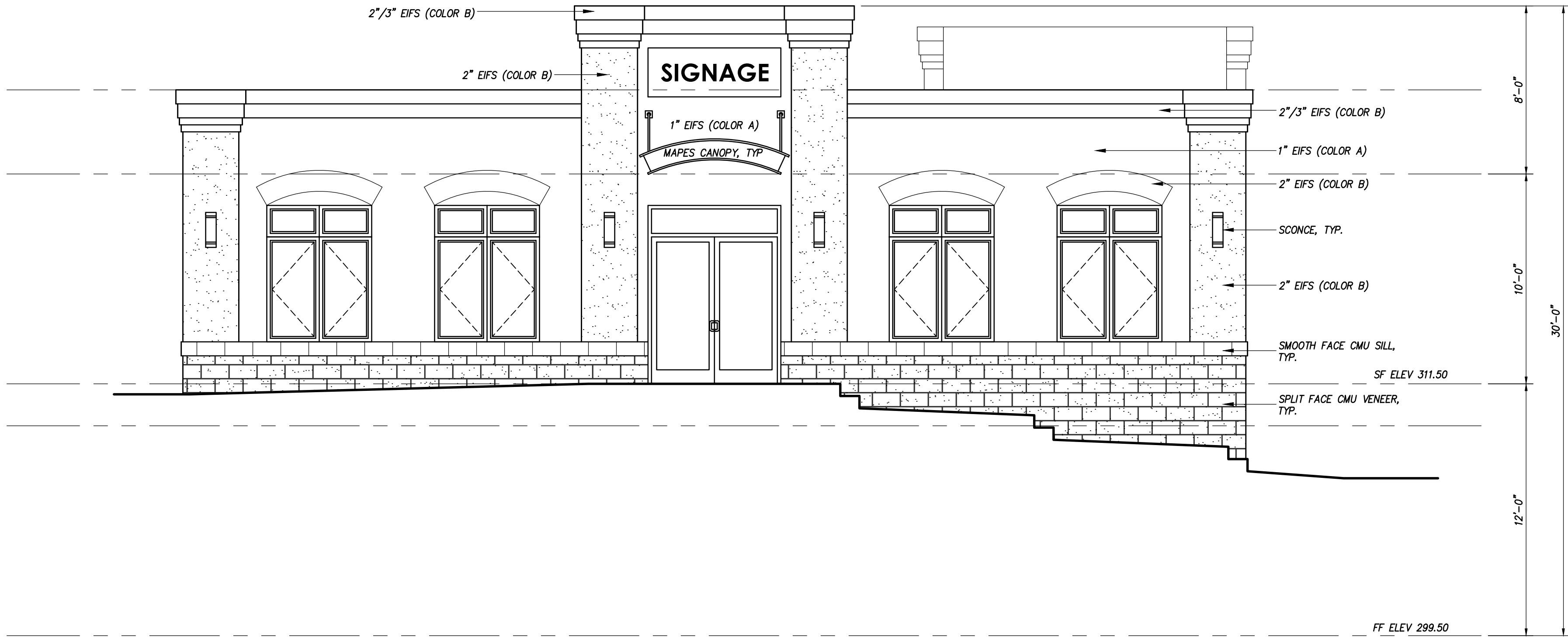
CHURCH RD ELEVATION